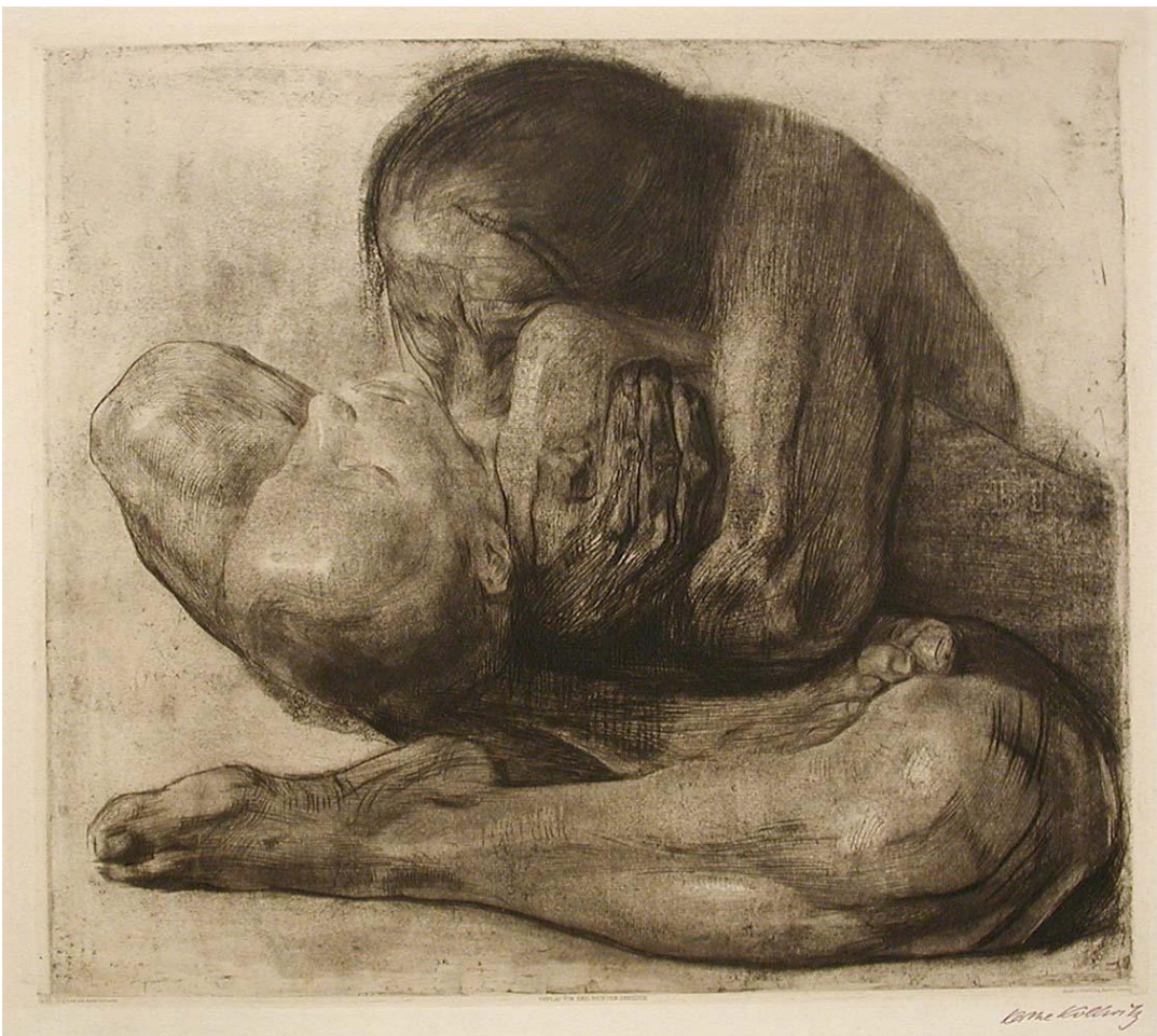
Käthe Kollwitz Woman with Dead Child 1903 Etching 39 x 48 cm Kunsthalle, Bremen