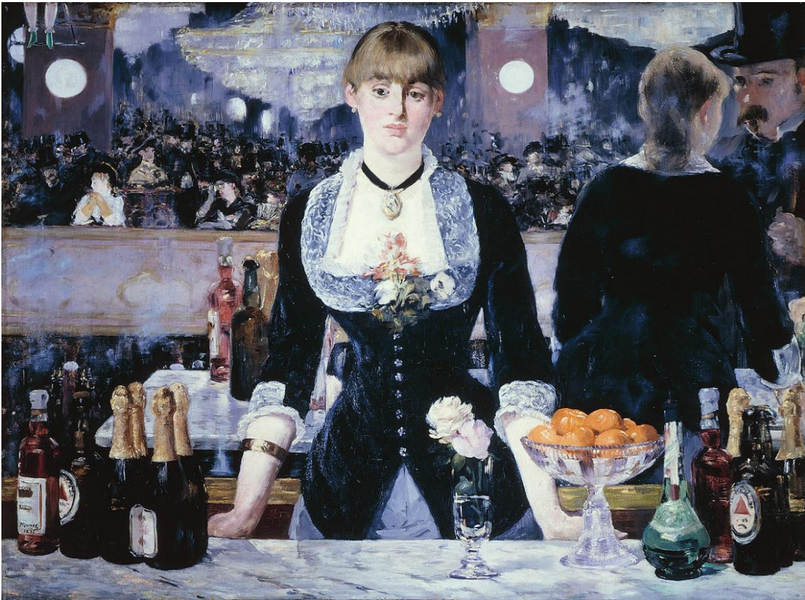
Édouard Manet, A Bar at the Folies-Bergère , 1881-82 Oil on canvas, 96 x 130 cm, Courtauld Gallery, London