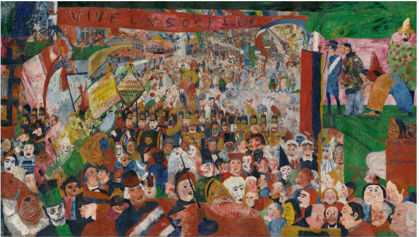
James Ensor, Christ's Entry into Brussels in 1889 , 1888 Oil on canvas, 252.7 x 430.5 cm, J. Paul Getty Museum